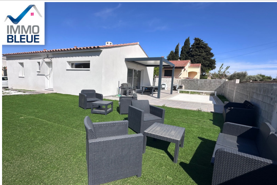
Villa 4182 Martigues

Fees paid by the owner, no current procedure, information on the risks to which this property is exposed is available on georisques.gouv.fr